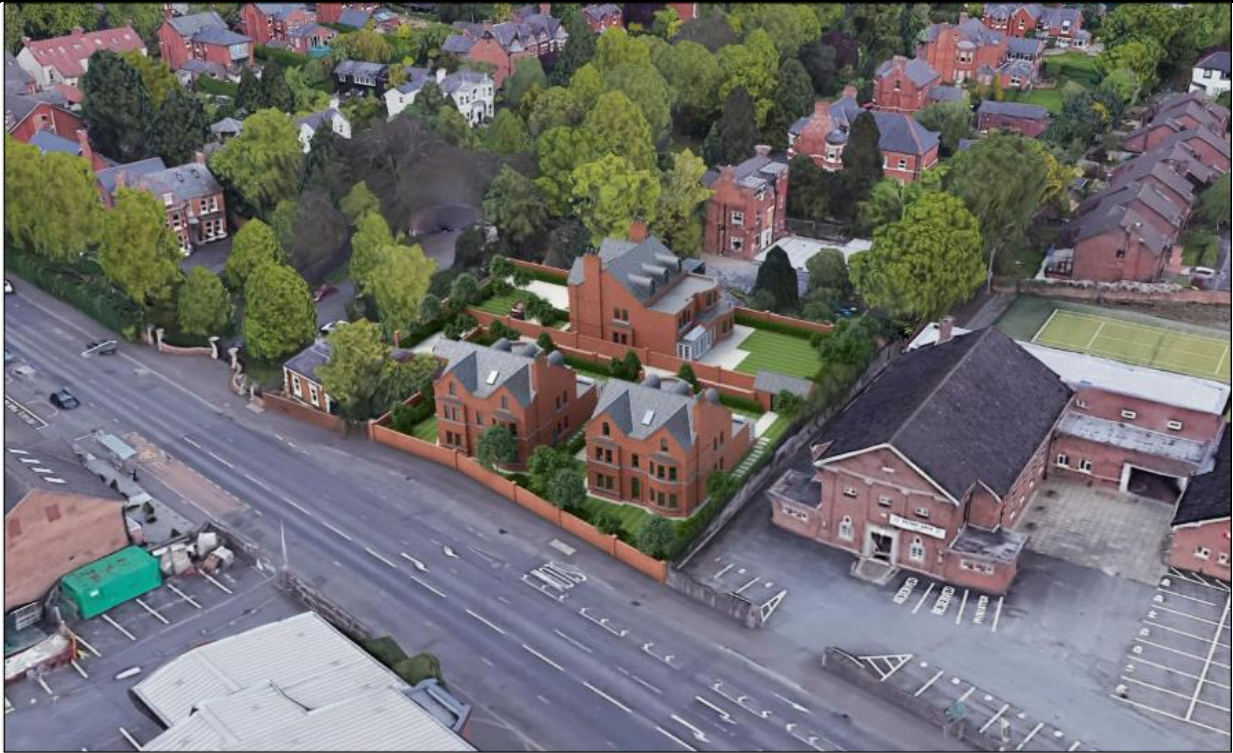
PROPOSED REPLACEMENT HOMES - ARTIST'S IMPRESSIONS- CONTEXTURAL AERIAL VIEW - CONTEXT CONSISTENT SCALE, BULK & MASSING