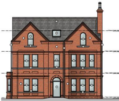
SIDE ELEVATION - FACING LISBURN ROAD

105-157 DONEGALL PASS BELFAST BT7 1DT T 028 9024 5777 F 028 9024 689 71 CLARENDON ST L DERRY BT48 7ER T 0287136 2794 F 028 7136 9829 E: INFO@RPPARCHITECTS.CO.UK W: RPPARCHITECTS.CO.UK